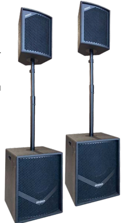
Picture showing two MF8 in an active system with two B11 self powered subwoofers. All amplification and processing are housed in the back of the subs, supplying high quality sound